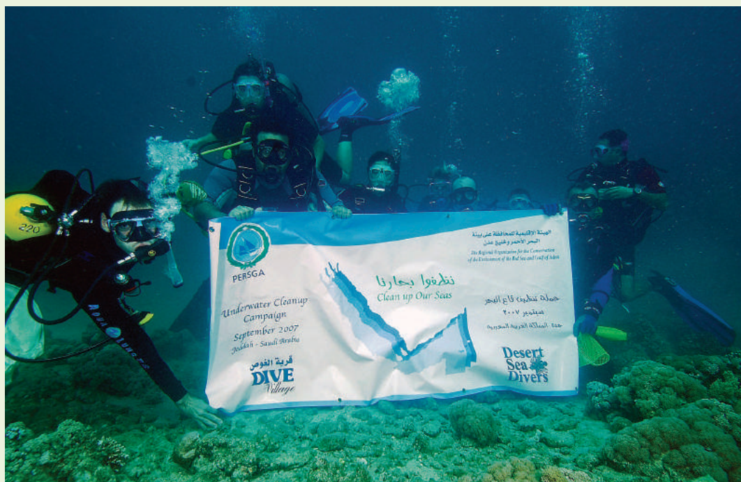
Figure 2: Underwater clean-up event, Jeddah, Saudi Arabia.

The objective of Component 2 is: Raise government and public awareness of the impact of marine litter to the marine environment, economy and human health through the implementation of education and awareness programs and literature. There are nine actions proposed to achieve this objective. These are shown in Table 4.