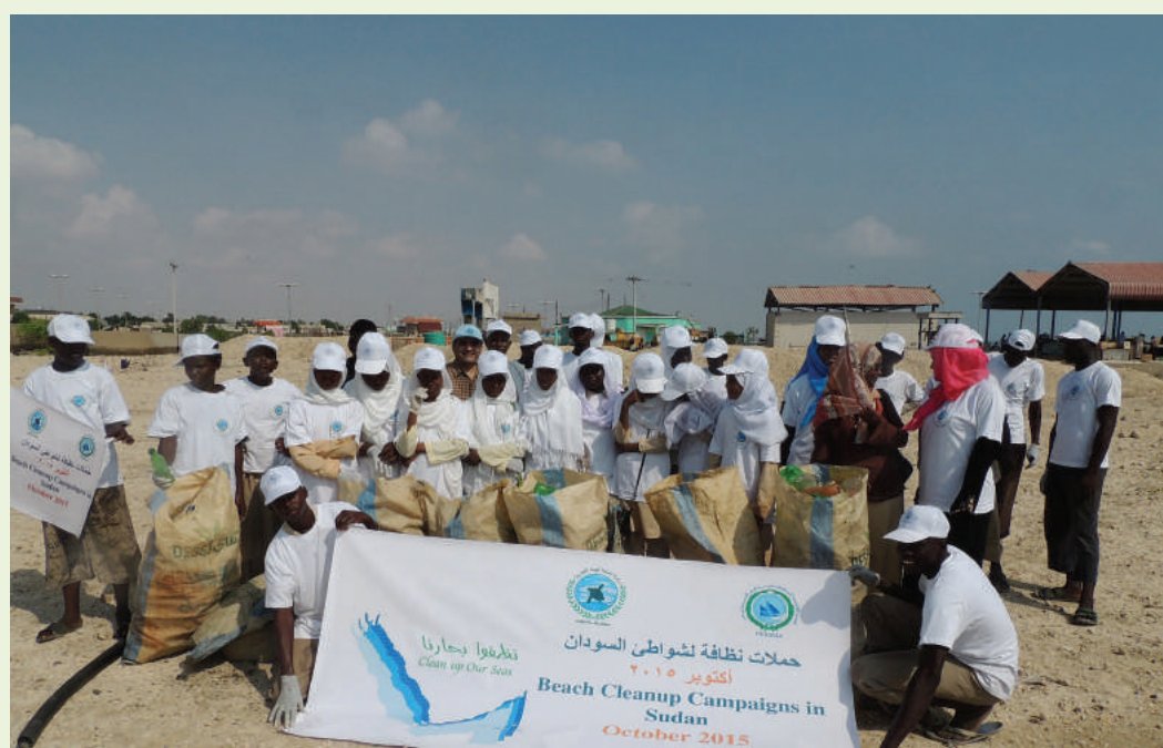
Figure 3: Beach clean-up and monitoring activity, Sudan.

The objective for Component 6 is: Undertake research to determine the source, density and composition of marine litter in each PERSGA member country. There are 15 actions proposed to achieve this objective. The actions are listed in Table 8.